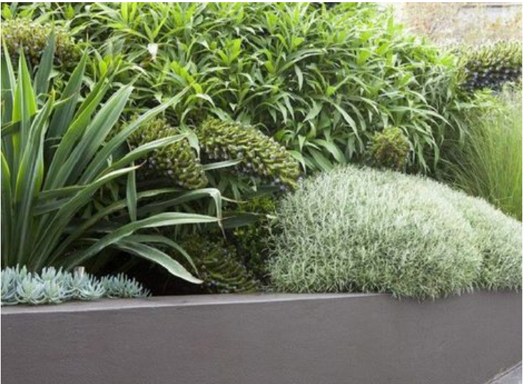
3 Trees and shrub planting