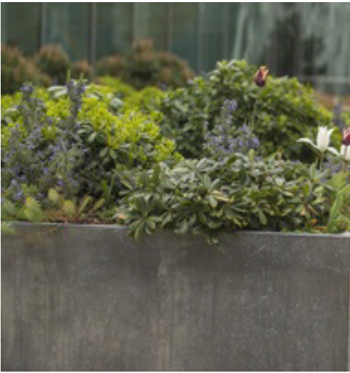
1 Granite clad planters to match Norfolk House stone