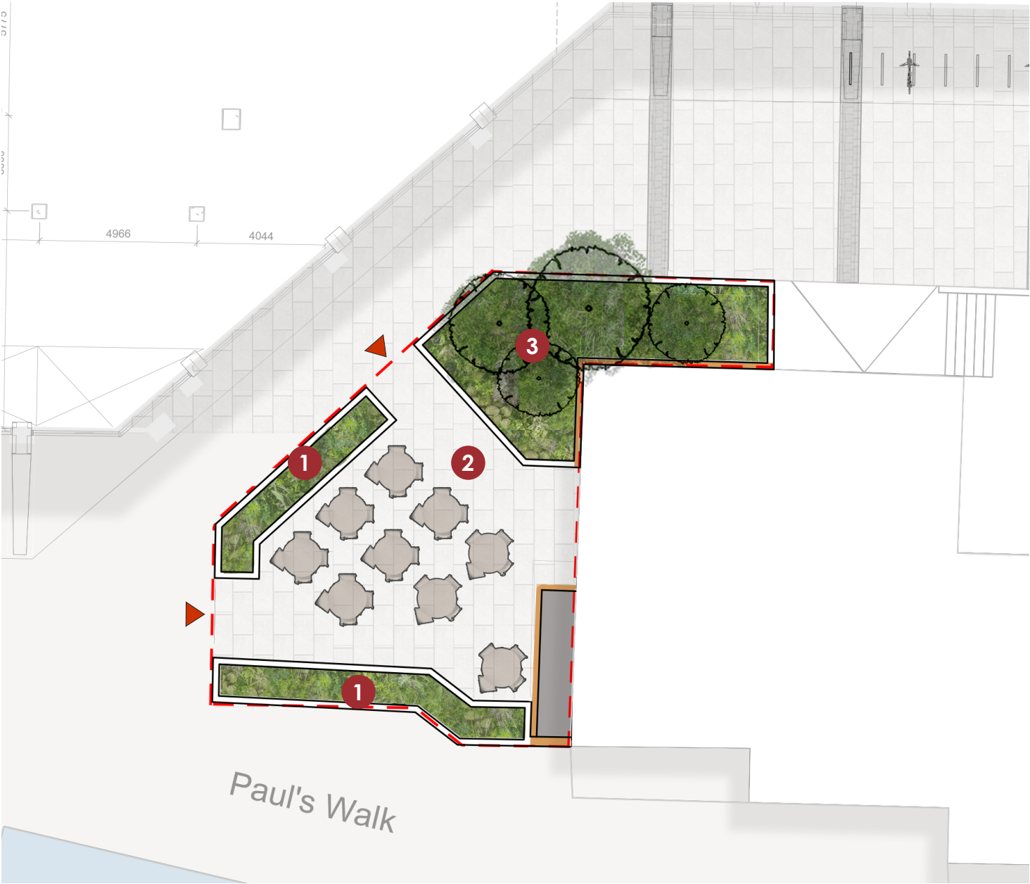
Proposed Terrace Plan