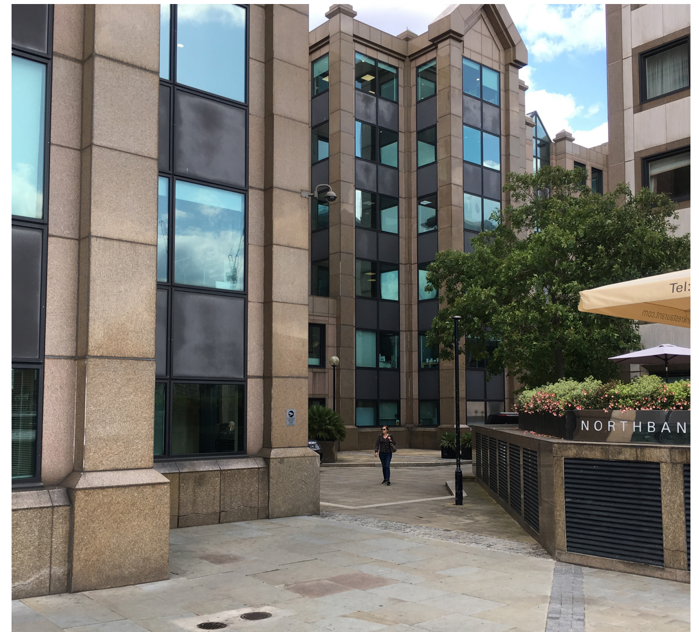
1 Existing View to Terrace