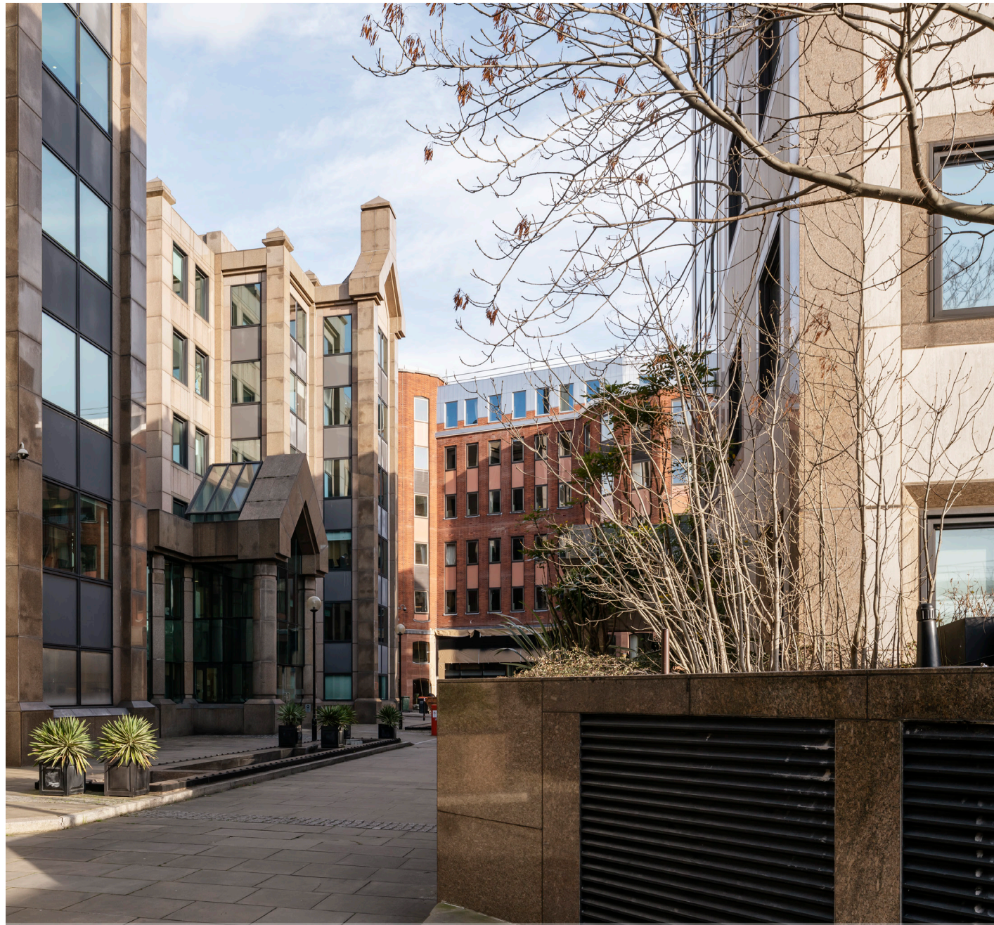
Existing View to Trig Lane