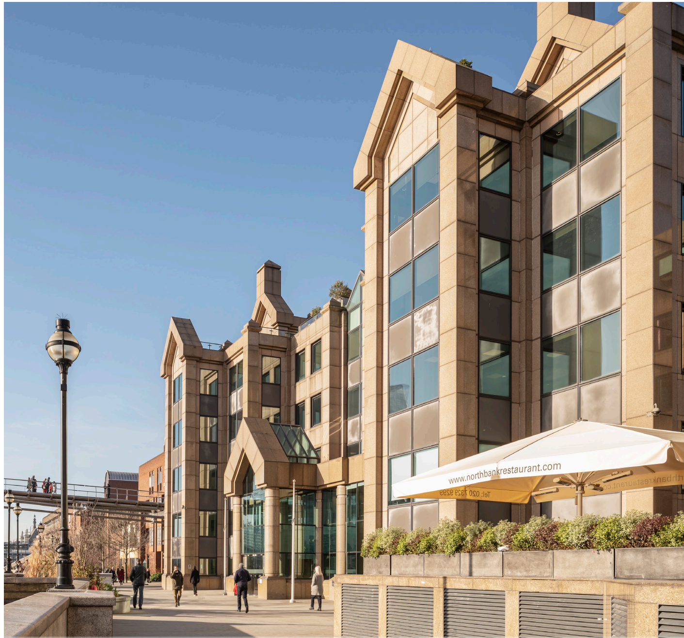
Existing View from Paul's Walk