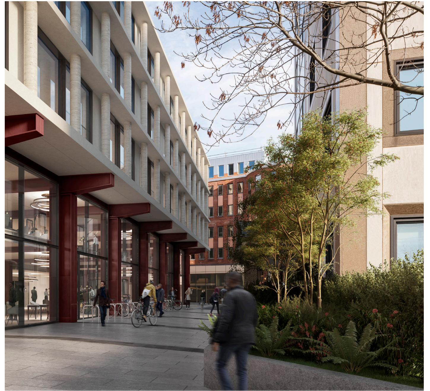
Proposed View to Trig Lane