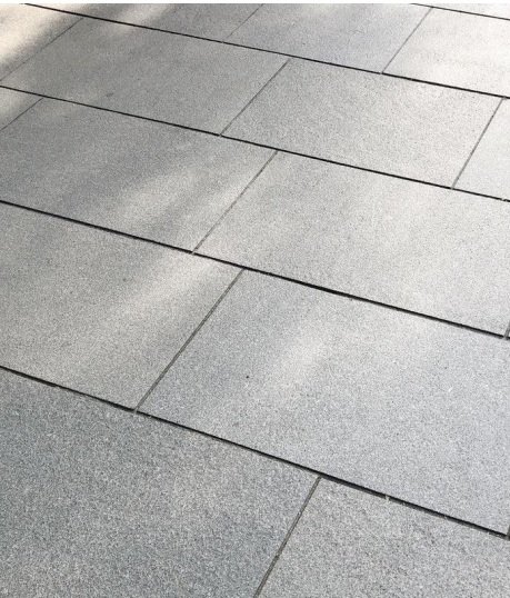
2 Natural stone paving