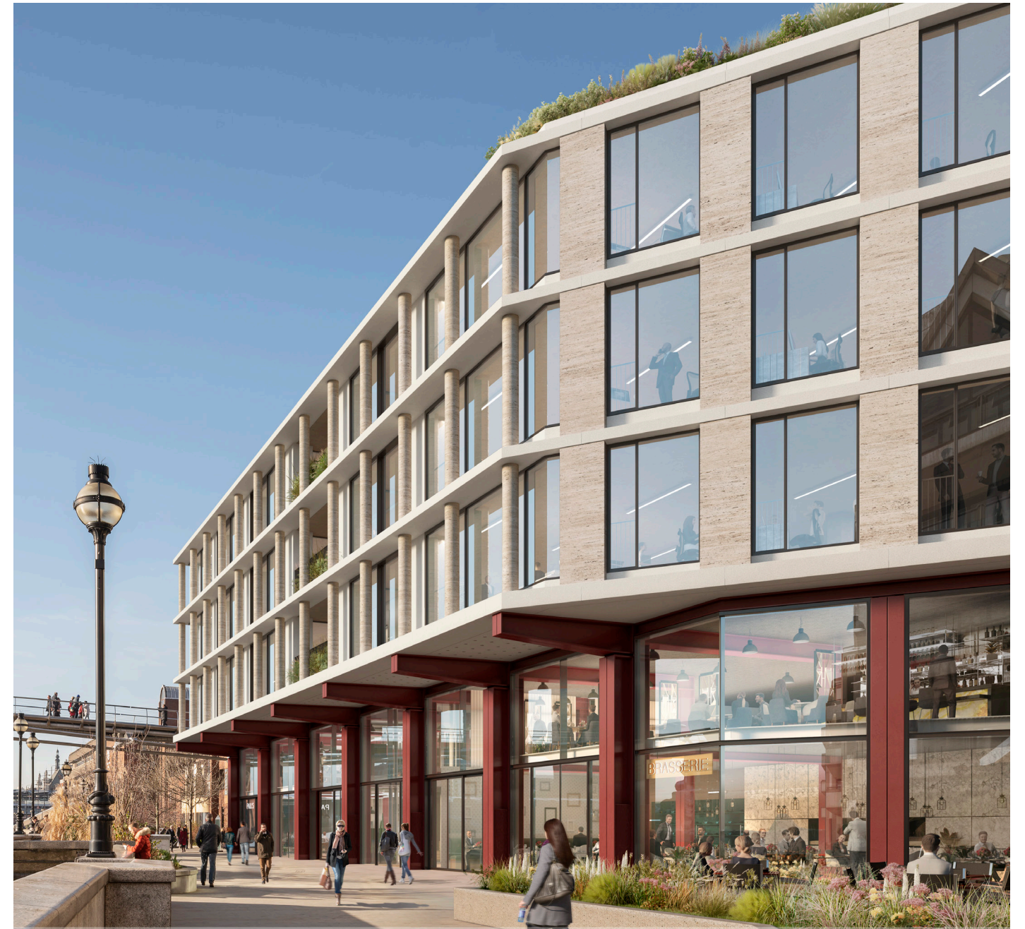
Proposed View from Paul's Walk